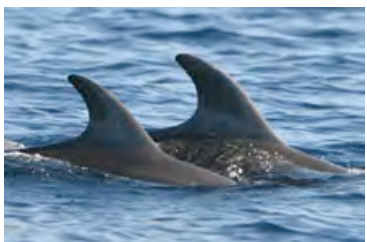
Photo-identification involves taking photographs of distinctive characteristics from an animal in order to identify and track individuals of a wild population over time. This technique has been used extensively with large and long-lived vertebrates for: population estimates, life history information, lifespan information, migration patterns, and social relationships of an individual. Find out how this technique is helping to understand the underwater world of the manta ray.